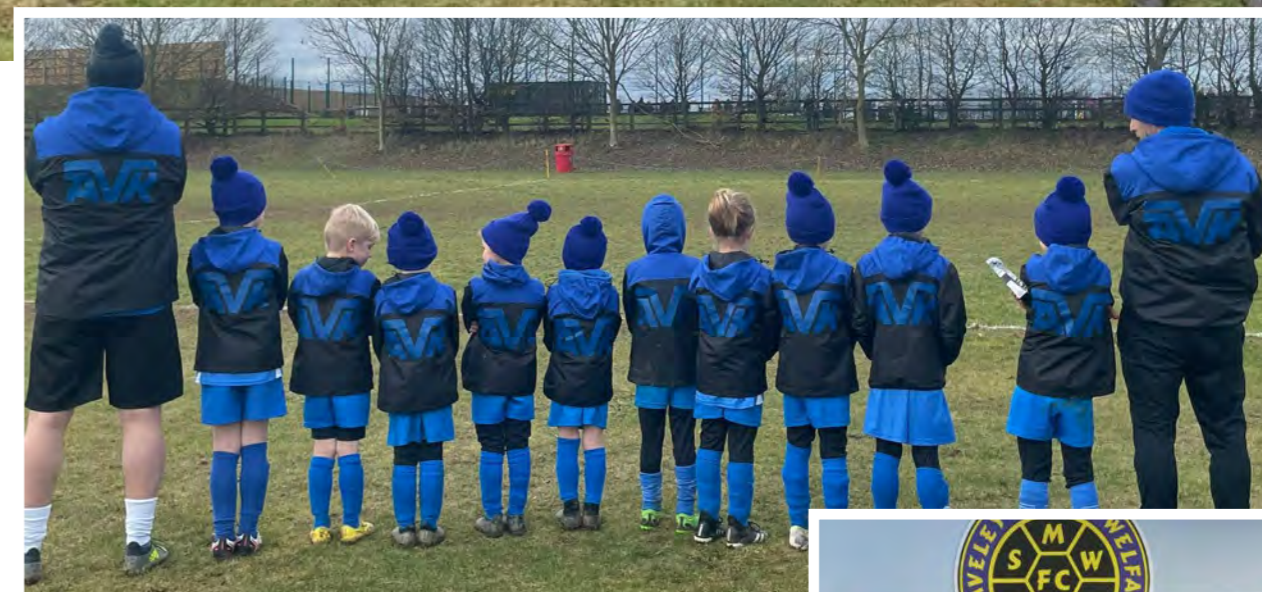
In March this year, AVK UK were delighted to announce our sponsorship of Staveley Miners Welfare Junior Football Club, pictured above and right. who are a competitive Junior Football Club based in Staveley, Derbyshire. Our donation will help to provide essential team kit for match days