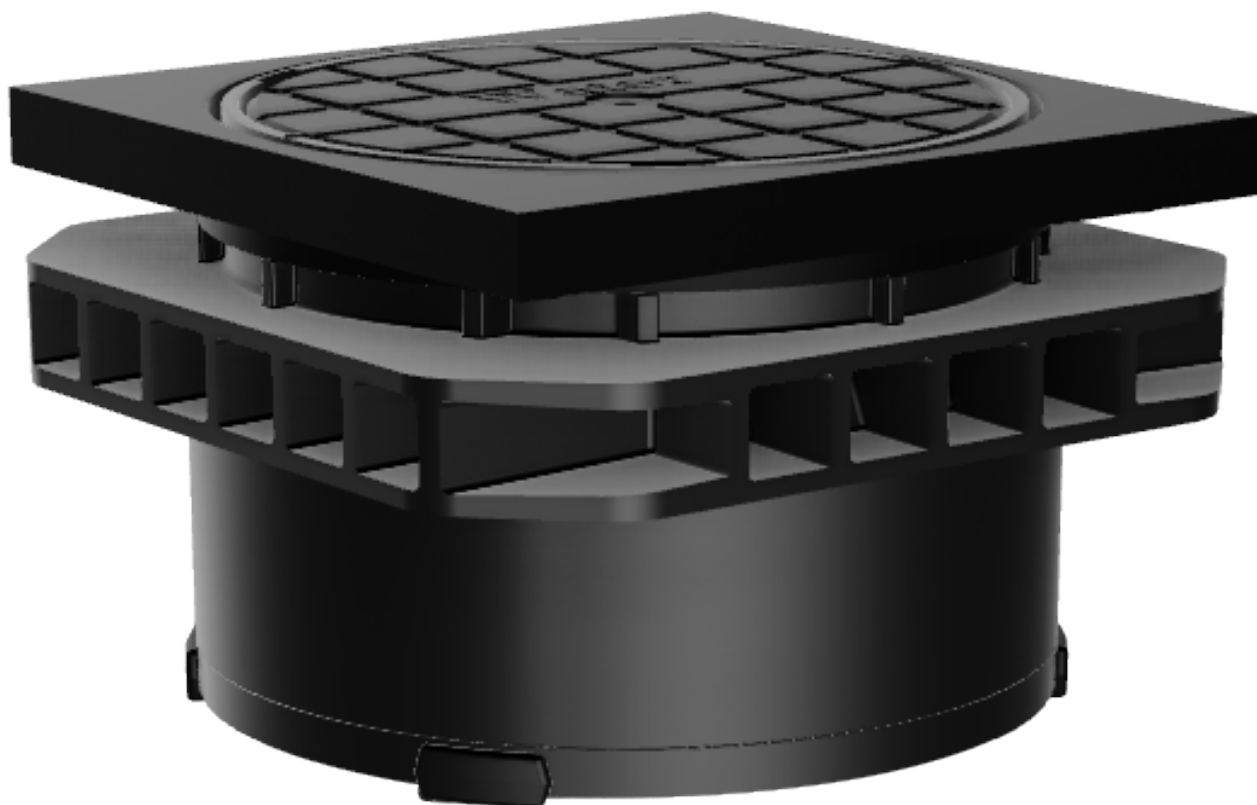
Matrix Grade B Surface Box